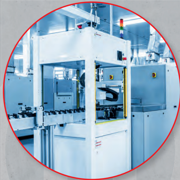
KombiSIGN 40 for equipment manufacturing, smaller machines, shipping and logistics