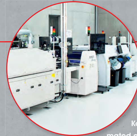
KombiSIGN 72 for machines, auto- mated equipment, shipping and logistics