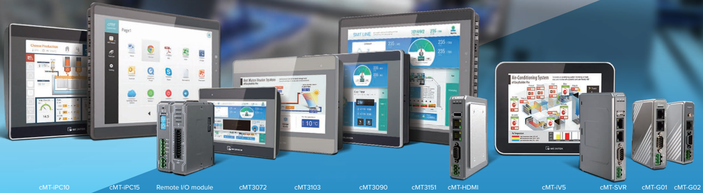
cMT-IPC10 cMT-IPC15 Remote I/O module cMT3072 cMT3103 cMT3090 cMT3151 cMT-HDMI cMT-iV5 cMT-SVR cMT-G01 cMT-G02

Placing your factory in the palm of your hand