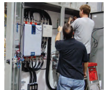
Quick Delivery on pre-configured systems