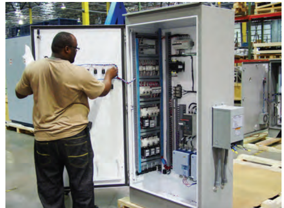
Careful attention to detail