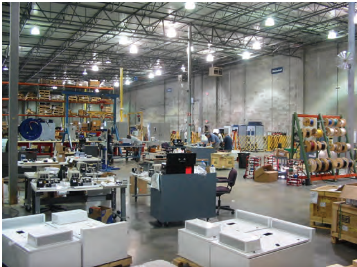
UL 508 certified shop