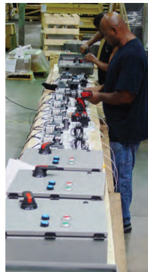
Quick turnaround on custom combination starters