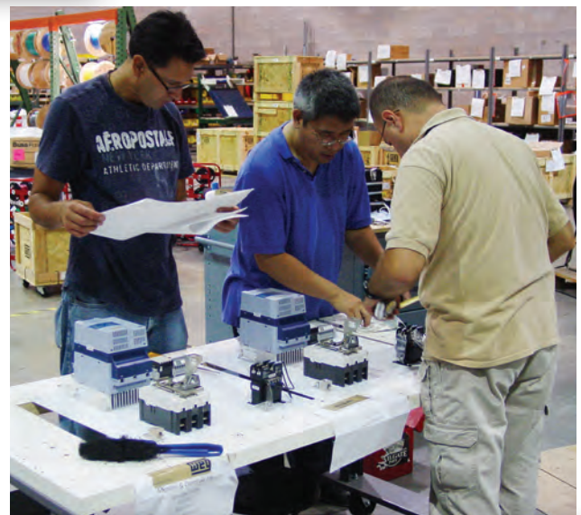
Quality American craftsmanship