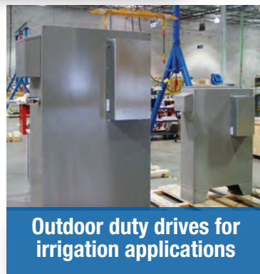
Outdoor duty drives for irrigation applications