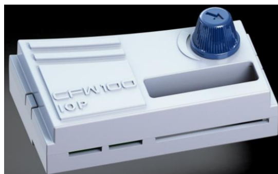
Figure 2 - New CFW100-IOP plug-in module

Prices and related information will be sent separately.