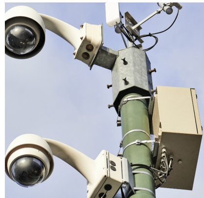
Surveillance and CCTV Systems