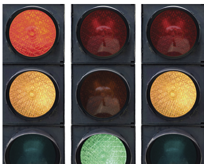
Traffic Control Systems