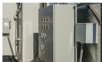
Rooftop Control Systems