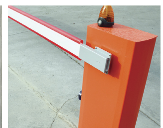
Parking Control Enclosures