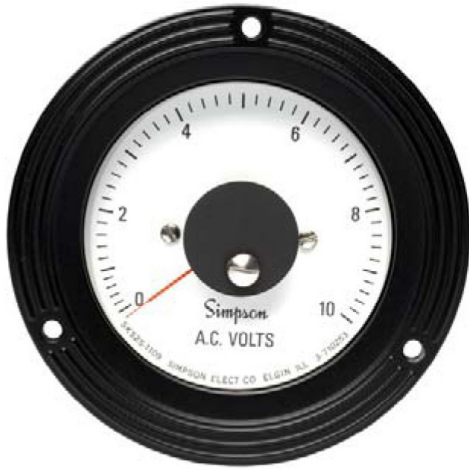
Round Style: 2523, 2524, 2543, 2544