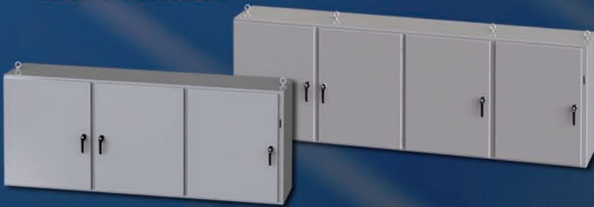
Free-Standing / Wall-Mount Disconnect