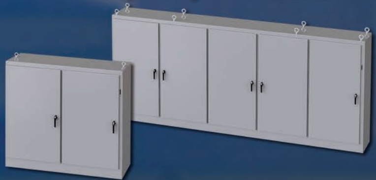
Heavy Duty Disconnect