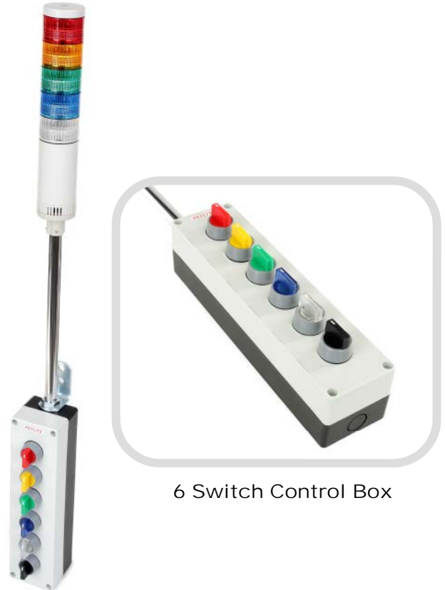
6 Switch Control Box