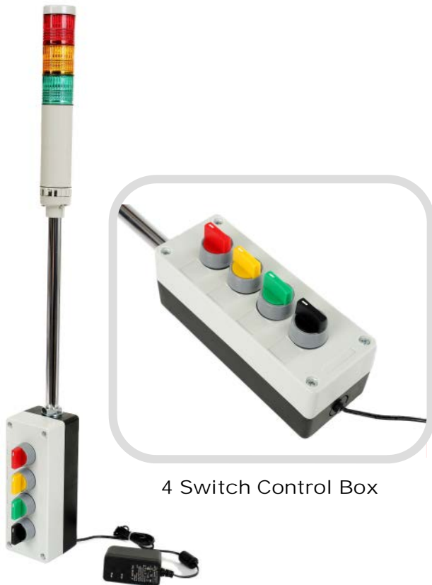
4 Switch Control Box