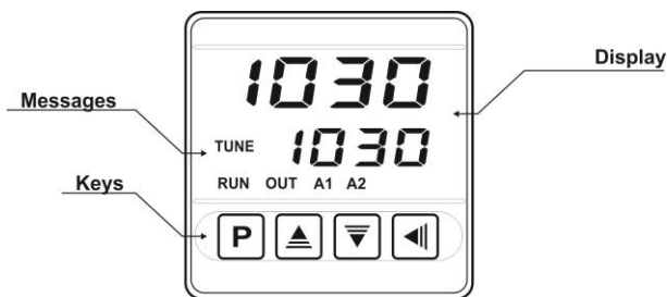
Fig. 02 - Identification of the parts referring to the front panel

The controller's front panel, with its parts, can be seen in the Fig. 02: