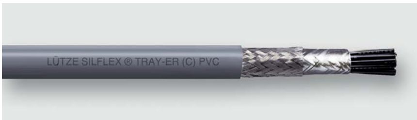
PVC control cables · shielded