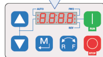
NEMA1 (Up to 10 HP) Keypad