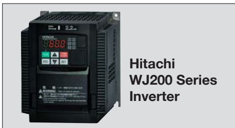
Hitachi WJ200 Series Inverter

Specialty pumps with extra hardware components add complexity. This complexity can lead to operator error that wastes water and energy and even decreases motor life due to overuse. Many pump specific inverters have a dizzying array of parameters for PID control that confuse the farmer. This makes setup and operation difficult and irrigation results unreliable. In contrast, software built specifically for irrigation applications can continuously control the PID output of a general purpose inverter while monitoring for seal leaks, pipe breaks, loss of prime etc. — even execute a line fill cycle that eliminates water hammer. For the farmer this means virtual push-button simplicity, lower maintenance costs and consistently optimized irrigation.