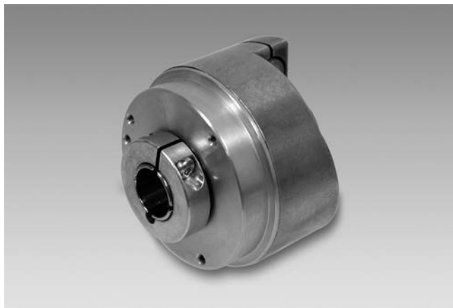
ITD21H00 with through hollow shaft